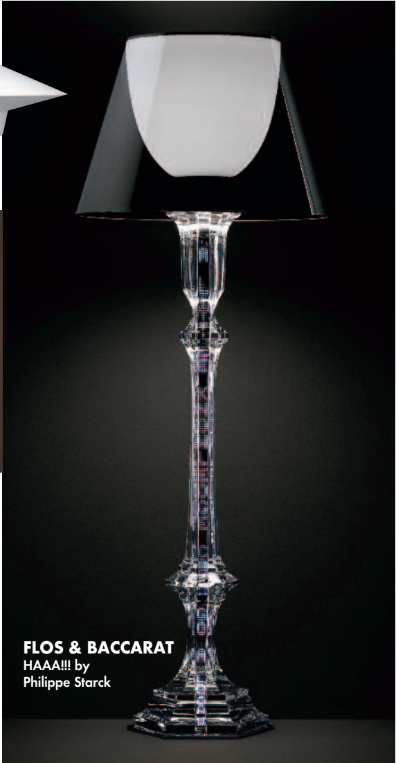
FLOS & BACCARAT HAAA!!! by Philippe Starck