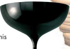
ROTALIANA Drink series