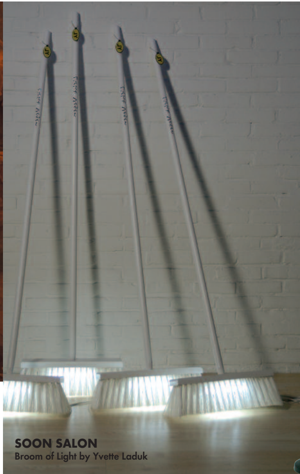
SOON SALON Broom of Light by Yvette Laduk