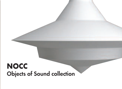
NOCC Objects of Sound collection