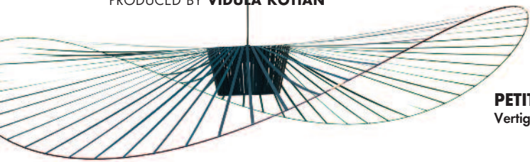
PETITE FRITURE Vertigo by Constance Guisset

You don't need to be afraid of the dark anymore nor of heights: Mr Gio is here to save you. The ladder illumination is made from a rotational moulding technique. So you don't hide your steps ever again. Just place it in any room for ambience. Available in colours from black to bright. Website: www.slidedesign.it