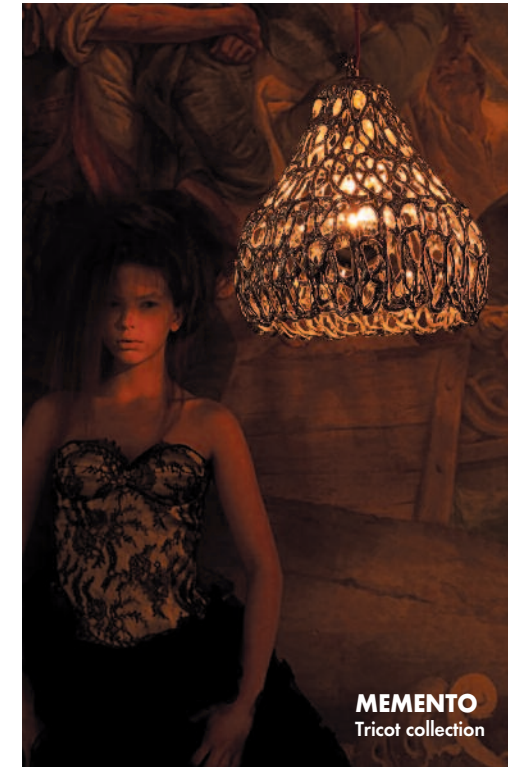
MEMENTO Tricot collection